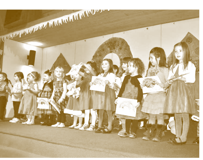
First Steps Preschool and Onteora's Universal Pre-K students helped spread some holiday magic in December, as they performed in a festive concert for family and friends.

The Onteora Central School District is currently accepting applications for its half-day Universal Pre-Kindergarten program for the 2015-2016 school year. Onteora residents who are the parent or guardian of a child who will be four years old on or before