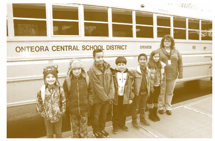
Woodstock Primary School students recently volunteered to make a video on bus safety as part of their school's PBIS program.

Fvery student, even the best-behaved ones, may behave inappropriately from time to time. They may get a little too rowdy on a school bus, for example, making it difficult for the driver to concentrate. In the cafeteria, they may forget to clean up after