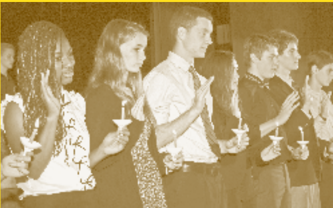
High School students participate in a candlelight ceremony marking their induction into the National Honor Society.