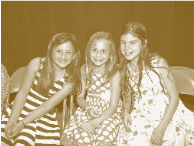
Phoenicia students are all smiles before their moving-up ceremony.