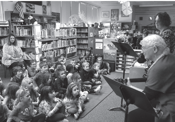
Woodstock students listening to a story-telling concert.