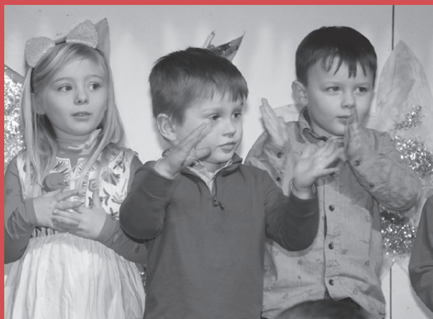
Onteora students enrolled in the Pre-K program administered by First Steps Preschool performing during a holiday concert.

Onteora is implementing an online registration process for the 2019-2020 school year for Kindergarten and Universal Pre-Kindergarten (UPK) students. To access the online forms, go to the District website and click on Departments, Registration & Residency. UPK online registration forms must be completed between March 1 and March 29, 2019. When your child is registered, their name will be added to a list from which our UPK students will be chosen. Kindergarten online registration forms must be completed between March 18 and April 12. After your child is registered, appointments will be made for Kindergarten screening. Kindergarten screening will be centralized this year, and will be held at the Central Administration offices in Boiceville during the week of May 6-10. Kindergarten parent information nights will be held at Woodstock and Phoenicia schools in mid-June. Please call 845-657-3320 with any questions.