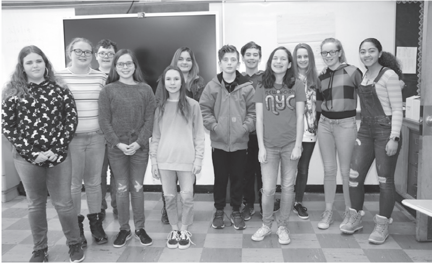
Middle School Student Government members pose for a group photo.

The Government's accomplishments to date include planning a holiday party for Middle School students, and collaborating with the National Junior Honor Society to wash and dry the clothing in the school's Lost and Found. The clothing was displayed on tables in the main hallway, with any unclaimed items being donated to charity. The students also wrote and administered surveys about the mid-terms to get feedback from the students.