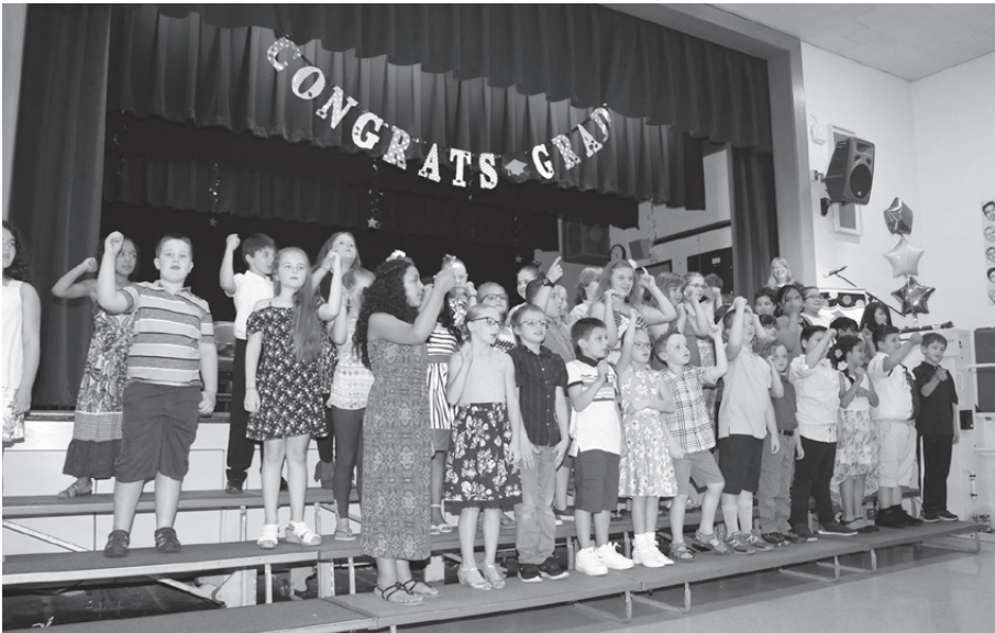
Phoenicia's Grade 3 students belted out their school's theme song, "Phoenicia is Dynamite," before taking the stage to receive their certificates.