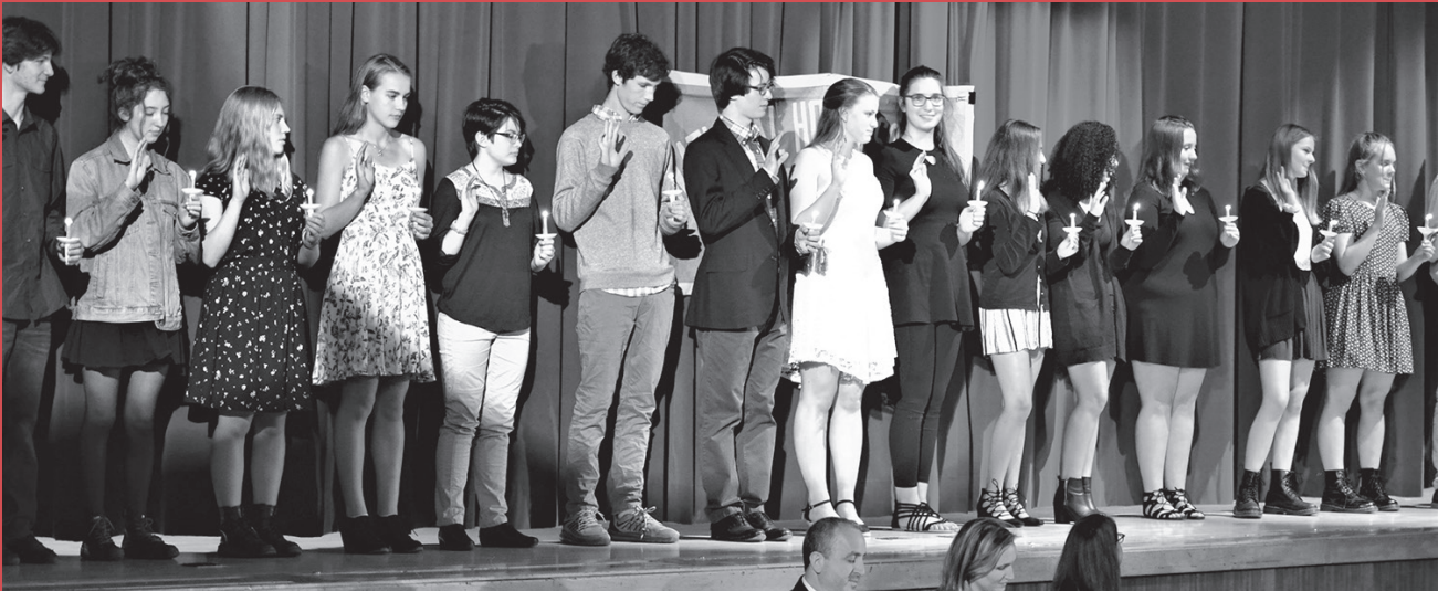
The newest members of Onteora’s chapter of the National Honor Society (NHS) recite the NHS pledge.